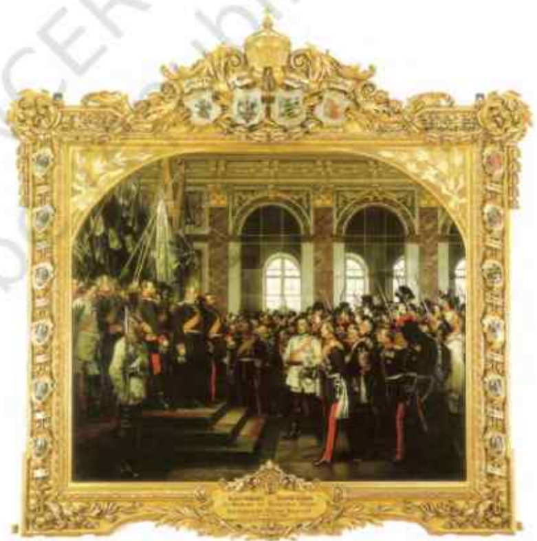
Fig. 11 – The proclamation of the German empire in the Hall of Mirrors at Versailles, Anton von Werner. At the centre stands the Kaiser and the chief commander of the Prussian army, General von Roon. Near them is Bismarck. This monumental work (2.7m x 2.7m) was completed and presented by the artist to Bismarck on the latter's 70th birthday in 1885.

The nation-building process in Germany had demonstrated the dominance of Prussian state power. The new state placed a strong emphasis on modernising the currency, banking, legal and judicial systems in Germany. Prussian measures and practices often became a model for the rest of Germany.