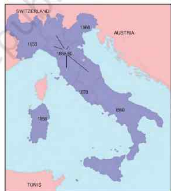
Fig. 14(b) — Italy after unification. The map shows the year in which different regions (seen in Fig 14(a)) become part of a unified Italy.