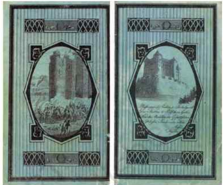
Fig. 2 – The cover of a German almanac designed by the journalist Andreas Rebmann in 1798.

When the news of the events in France reached the different cities of Europe, students and other members of educated middle classes began setting up Jacobin clubs. Their activities and campaigns prepared the way for the French armies which moved into Holland, Belgium, Switzerland and much of Italy in the 1790s. With the outbreak of the revolutionary wars, the French armies began to carry the idea of nationalism abroad.