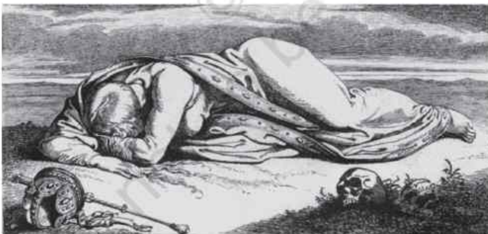
Fig. 18 – The fallen Germania , Julius Hübner, 1850.