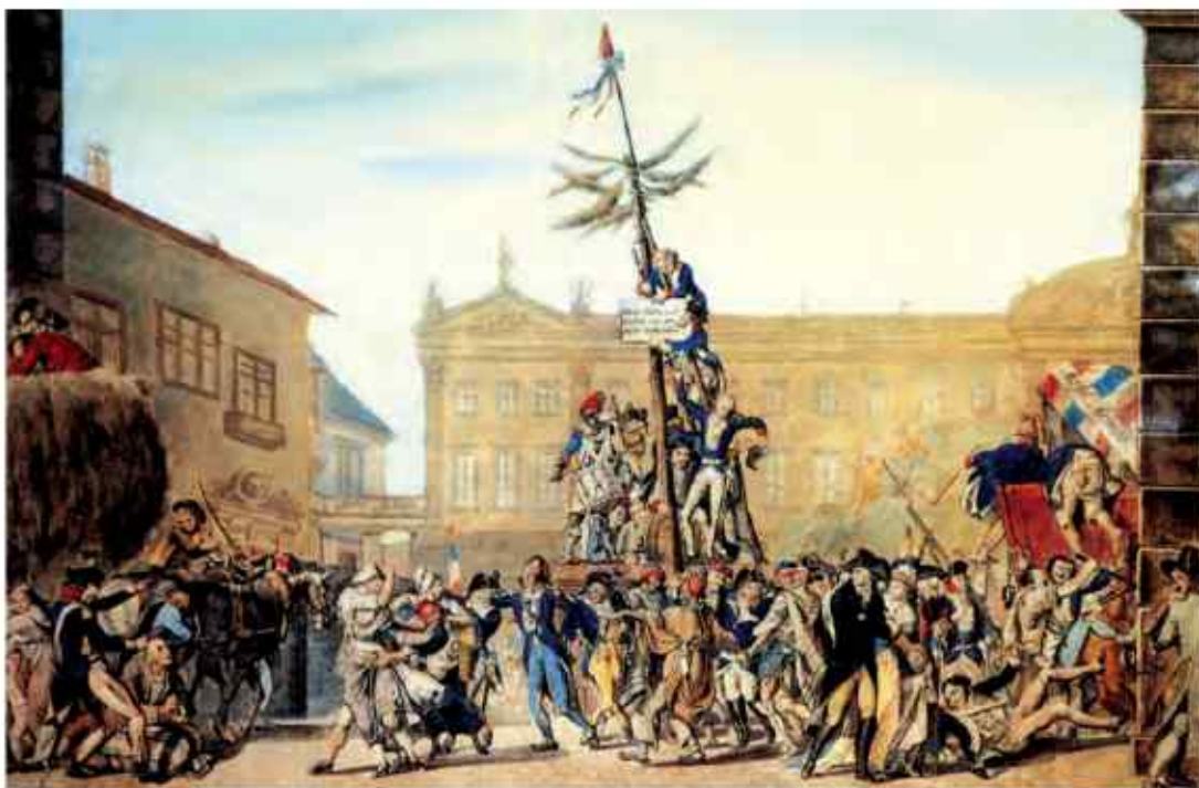
Fig. 4 — The Planting of Tree of Liberty in Zweibrücken, Germany.

The subject of this colour print by the German painter Karl Kaspar Fritz is the occupation of the town of Zweibrücken by the French armies. French soldiers, recognisable by their blue, white and red uniforms, have been portrayed as oppressors as they seize a peasant's cart (left), harass some young women (centre foreground) and force a peasant down to his knees. The plaque being affixed to the Tree of Liberty carries a German inscription which in translation reads: 'Take freedom and equality from us, the model of humanity.' This is a sarcastic reference to the claim of the French as being liberators who opposed monarchy in the territories they entered.