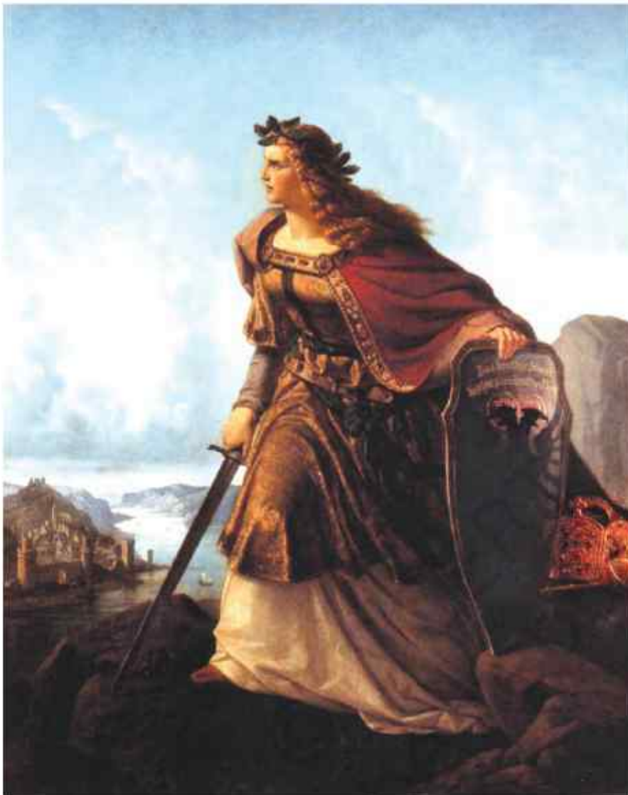
Fig. 19 — Germania guarding the Rhine. In 1860, the artist Lorenz Clasen was commissioned to paint this image. The inscription on Germania's sword reads: "The German sword protects the German Rhine."