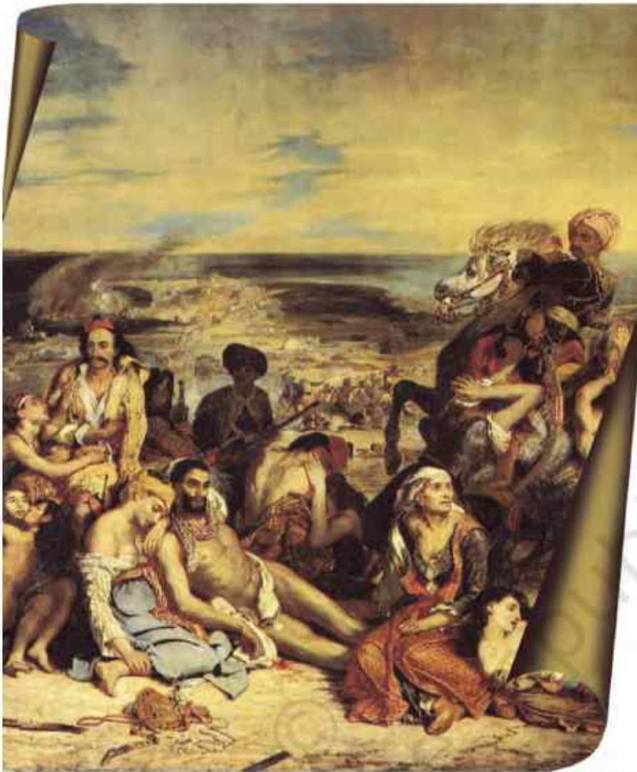
Fig. 8 – The Massacre at Chios, Eugene Delacroix, 1824.

The French painter Delacroix was one of the most important French Romantic painters. This huge painting (4.19m x 3.54m) depicts an incident in which 20,000 Greeks were said to have been killed by Turks on the island of Chios. By dramatising the incident, focusing on the suffering of women and children, and using vivid colours, Delacroix sought to appeal to the emotions of the spectators, and create sympathy for the Greeks.