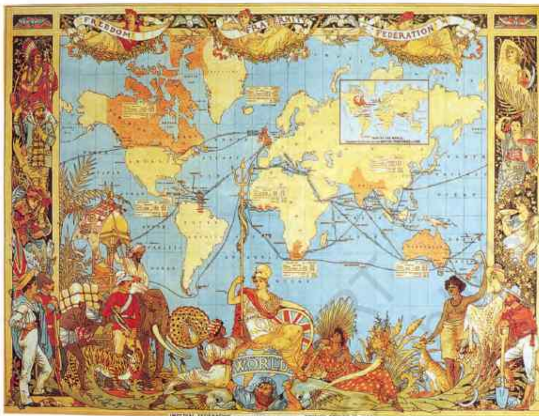
Fig. 20 – A map celebrating the British Empire.

At the top, angels are shown carrying the banner of freedom. In the foreground, Britannia – the symbol of the British nation – is triumphantly sitting over the globe. The colonies are represented through images of tigers, elephants, forests and primitive people. The domination of the world is shown as the basis of Britain's national pride.