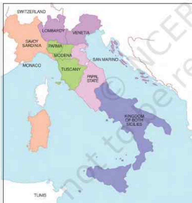
Fig. 14(a) — Italian states before unification, 1858.

Look at Fig. 14(a). Do you think that the people living in any of these regions thought of themselves as Italians? Examine Fig. 14(b). Which was the first region to become a part of unified Italy? Which was the last region to join? In which year did the largest number of states join?