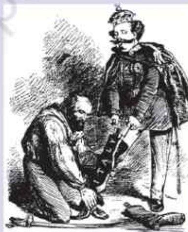
Fig. 15 – Garibaldi helping King Victor Emmanuel II of Sardinia-Piedmont to pull on the boot named 'Italy'. English caricature of 1859.

In 1867, Garibaldi led an army of volunteers to Rome to fight the last obstacle to the unification of Italy, the Papal States where a French garrison was stationed. The Red Shirts proved to be no match for the combined French and Papal troops. It was only in 1870 when, during the war with Prussia, France withdrew its troops from Rome that the Papal States were finally joined to Italy.