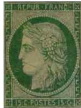
Fig. 16 – Postage stamps of 1850 with the figure of Marianne representing the Republic of France.

Allegory – When an abstract idea (for instance, greed, envy, freedom, liberty) is expressed through a person or a thing. An allegorical story has two meanings, one literal and one symbolic