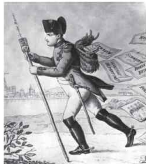
Fig. 5 — The courier of Rhineland loses all that he has on his way home from Leipzig.

However, in the areas conquered, the reactions of the local populations to French rule were mixed. Initially, in many places such as Holland and Switzerland, as well as in certain cities like Brussels, Mainz, Milan and Warsaw, the French armies were welcomed as harbingers of liberty. But the initial enthusiasm soon turned to hostility, as it became clear that the new administrative arrangements did not go hand in hand with political freedom. Increased taxation, censorship, forced conscription into the French armies required to conquer the rest of Europe, all seemed to outweigh the advantages of the administrative changes.