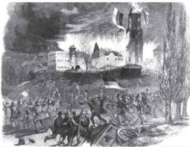
Fig. 9 – Peasants' uprising, 1848.

National Assembly proclaimed a Republic, granted suffrage to all adult males above 21, and guaranteed the right to work. National workshops to provide employment were set up.