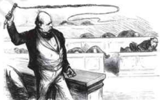
Fig. 13 – Caricature of Otto von Bismarck in the German reichstag (parliament), from Figaro, Vienna, 5 March 1870.

During the 1830s, Giuseppe Mazzini had sought to put together a coherent programme for a unitary Italian Republic. He had also formed a secret society called Young Italy for the dissemination of his goals. The failure of revolutionary uprisings both in 1831 and 1848 meant that the mantle now fell on Sardinia-Piedmont under its ruler King Victor Emmanuel II to unify the Italian states through war. In the eyes of the ruling elites of this region, a unified Italy offered them the possibility of economic development and political dominance.