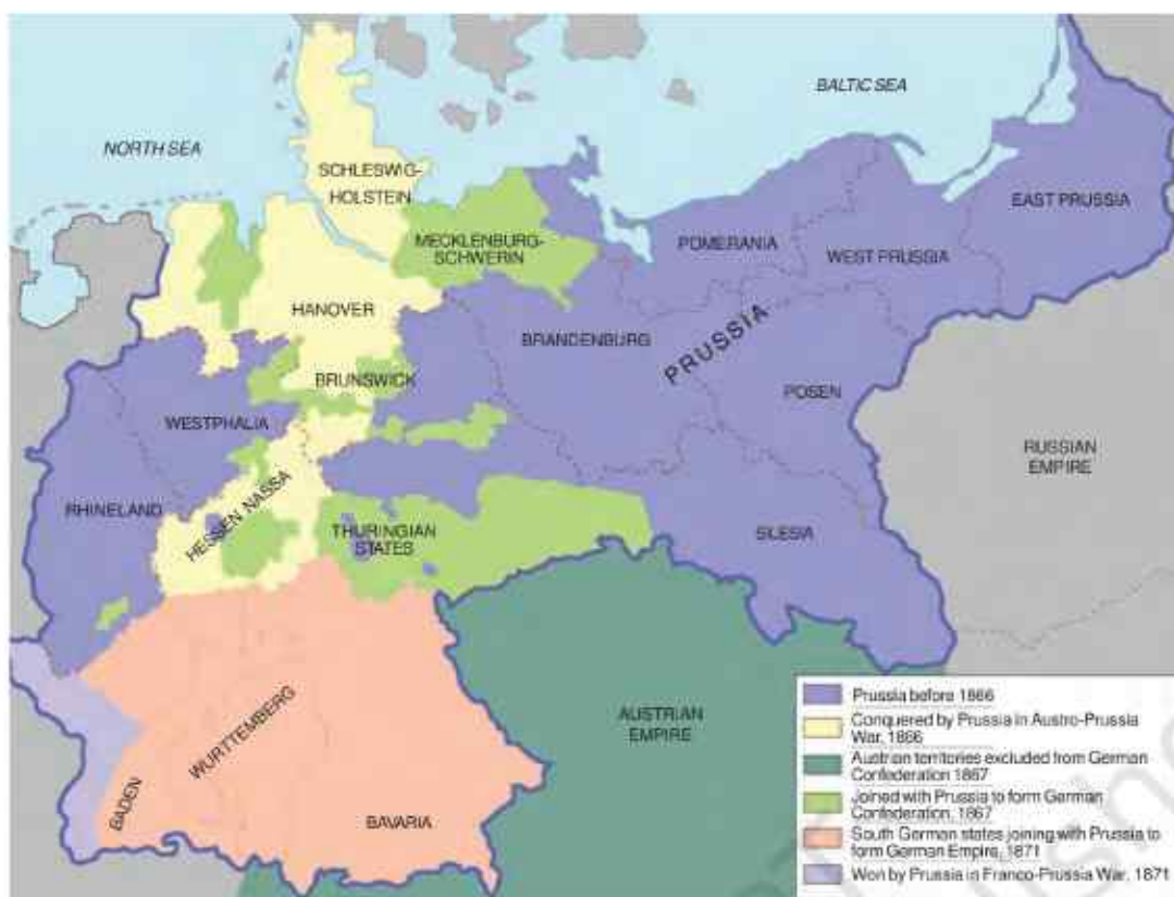
Fig. 12 – Unification of Germany (1866-71).