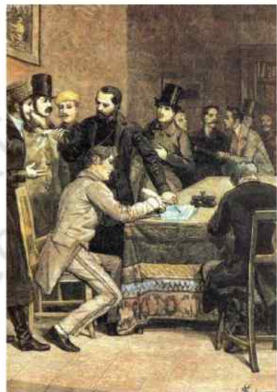
Fig. 7 — Giuseppe Mazzini and the founding of Young Europe in Berne 1833. Print by Giacomo Mantegazza.

One such individual was the Italian revolutionary Giuseppe Mazzini. Born in Genoa in 1807, he became a member of the secret society of the Carbonari. As a young man of 24, he was sent into exile in 1831 for attempting a revolution in Liguria. He subsequently founded two more underground societies, first, Young Italy in Marseilles, and then, Young Europe in Berne, whose members were like-minded young men from Poland, France, Italy and the German states. Mazzini believed that God had intended nations to be the natural units of mankind. So Italy could not continue to be a patchwork of small states and kingdoms. It had to be forged into a single unified republic within a wider alliance of nations. This unification alone could be the basis of Italian liberty. Following his model, secret societies were set up in Germany, France, Switzerland and Poland. Mazzini's relentless opposition to monarchy and his vision of democratic republics frightened the conservatives. Metternich described him as 'the most dangerous enemy of our social order'.