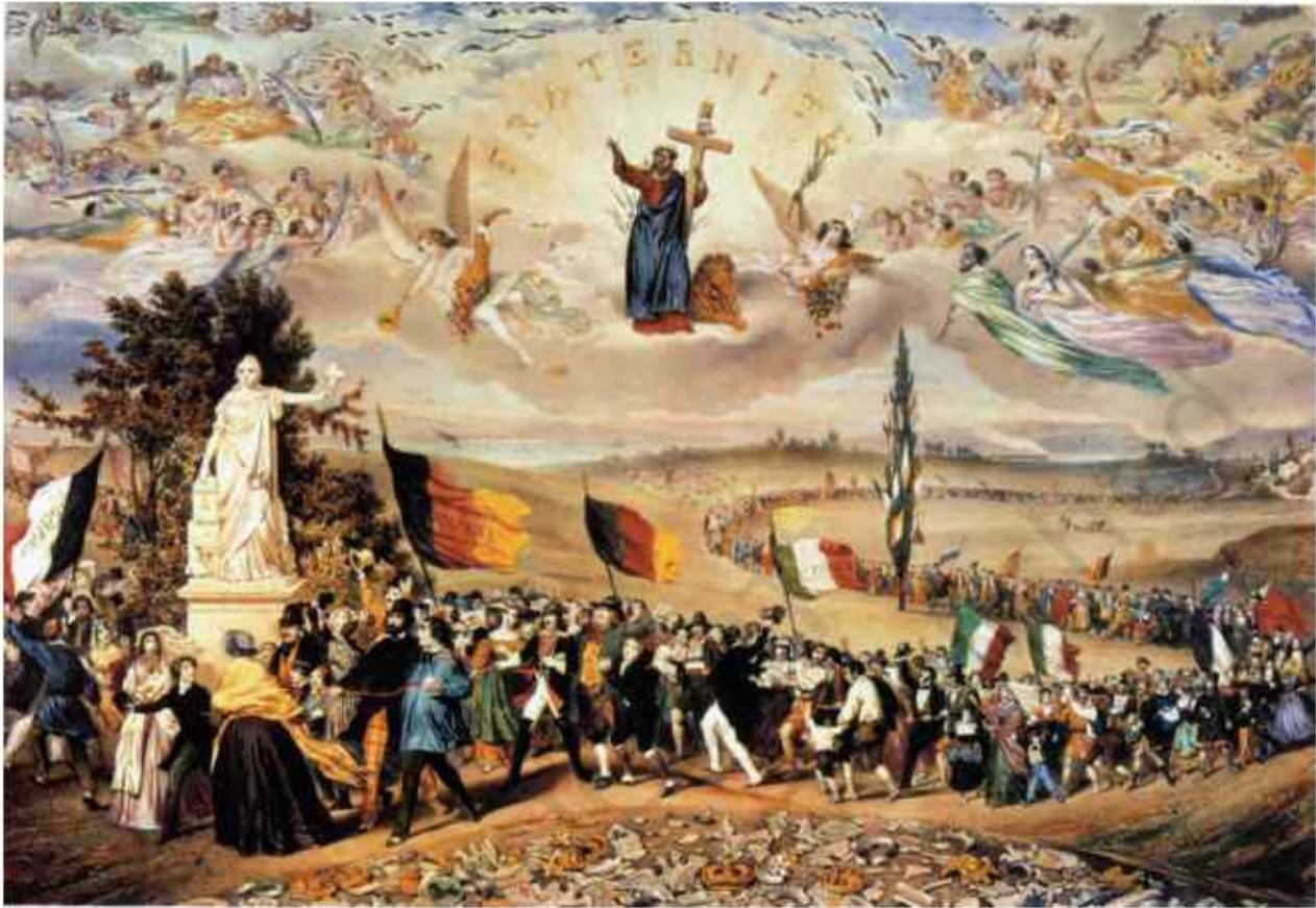
Fig. 1 – The Dream of Worldwide Democratic and Social Republics – The Pact Between Nations , a print prepared by Frédéric Sorrieu, 1848.

In 1848, Frédéric Sorrieu, a French artist, prepared a series of four prints visualising his dream of a world made up of 'democratic and social Republics', as he called them. The first print (Fig. 1) of the series, shows the peoples of Europe and America – men and women of all ages and social classes – marching in a long train, and offering homage to the statue of Liberty as they pass by it. As you would recall, artists of the time of the French Revolution personified Liberty as a female figure – here you can recognise the torch of Enlightenment she bears in one hand and the Charter of the Rights of Man in the other. On the earth in the foreground of the image lie the shattered remains of the symbols of absolutist institutions. In Sorrieu's utopian vision, the peoples of the world are grouped as distinct nations, identified through their flags and national costume. Leading the procession, way past the statue of Liberty, are the United States and Switzerland, which by this time were already nation-states. France,