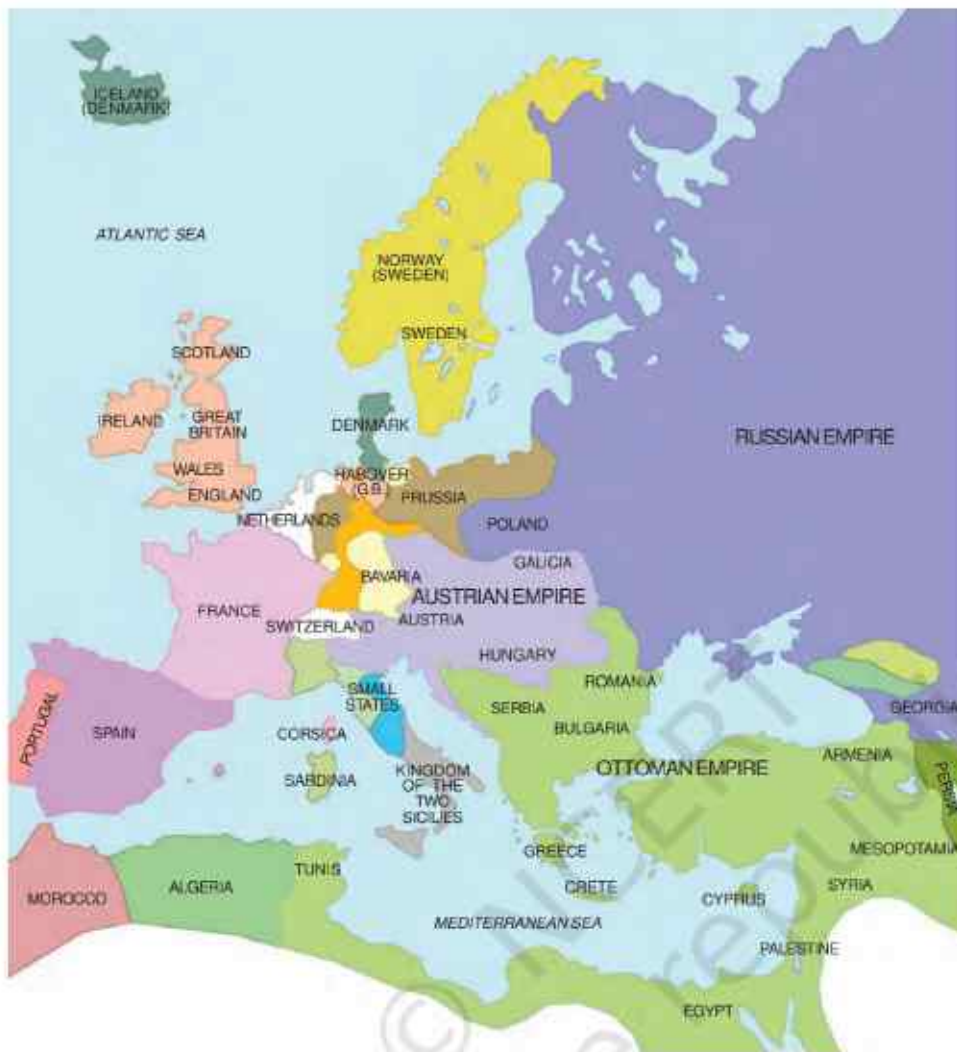
Fig. 3 – Europe after the Congress of Vienna, 1815.

Within the wide swathe of territory that came under his control, Napoleon set about introducing many of the reforms that he had already introduced in France. Through a return to monarchy Napoleon had, no doubt, destroyed democracy in France, but in the administrative field he had incorporated revolutionary principles in order to make the whole system more rational and efficient. The Civil Code of 1804 – usually known as the Napoleonic Code – did away with all privileges based on birth, established equality before the law and secured the right to property. This Code was exported to the regions under French control. In the Dutch Republic, in Switzerland, in Italy and Germany, Napoleon simplified administrative divisions, abolished the feudal system and freed peasants from serfdom and manorial dues. In the towns too, guild restrictions were removed. Transport and communication systems were improved. Peasants, artisans, workers and new businessmen