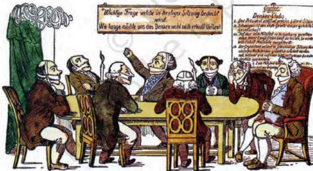
Fig. 6 – The Club of Thinkers, anonymous caricature dating to c. 1820.

What is the caricaturist trying to depict?